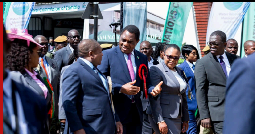
Presidential Tour: H.E Hakainde Hichilema President of the Republic of Zambia and Patron of ZITFT and Guest of Honour H.E Felipe Jacinto Nyuci, President of the Republic of Mozambique, in the entourage of ministers and Board of Trustees of ZITFT