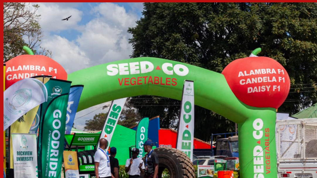
Exhibition Highlights: The Agriculture Sector